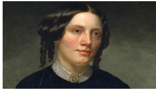
HARRIET BEECHER STOWE