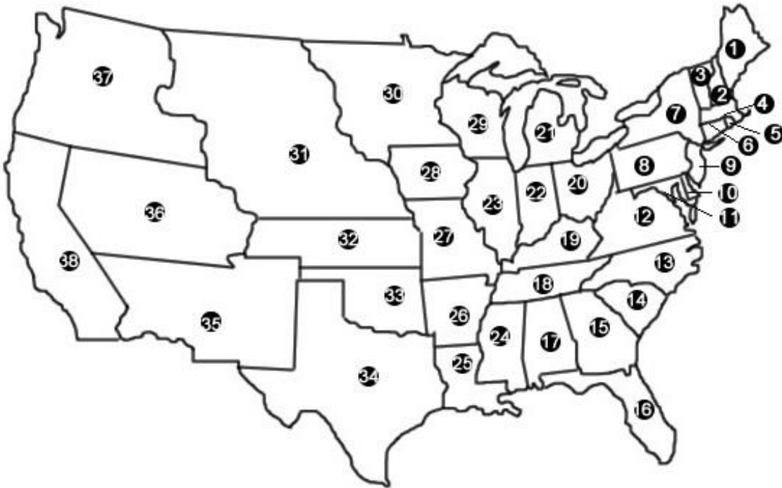
Label the Map Above